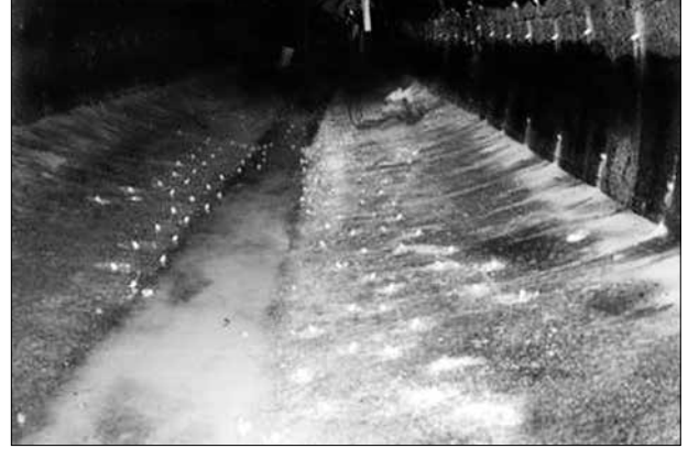
Gel encapsulation injection.