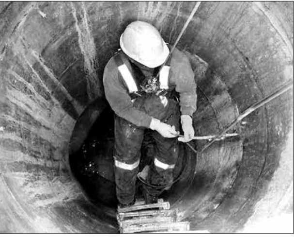
Manhole joint injection.

For NSF/ANSI 61 use restrictions visit: www.wqa.org