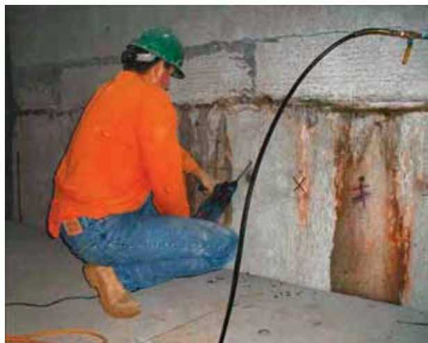
Figure 3 Drilling continues along the construction joint.