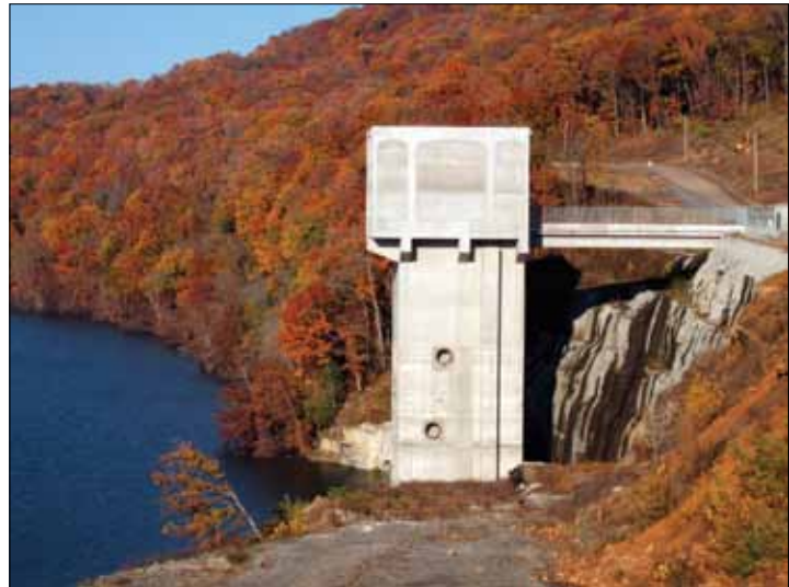
Figure 1 The concrete intake tower at Lake Fort Smith State Park.