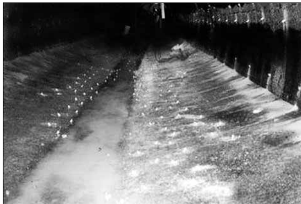
Gel encapsulation injection.