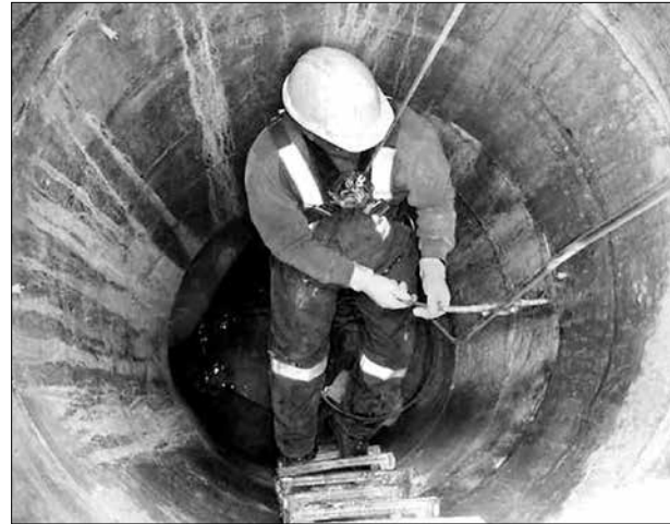
Manhole joint injection.

For NSF/ANSI/CAN 61 use restrictions visit: www.wqa.org